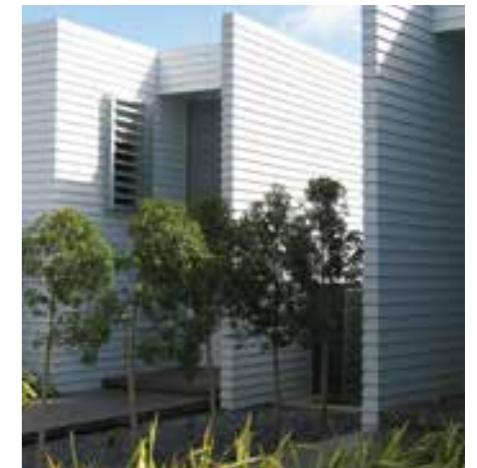
Timber weatherboards have around a 25% market share for residential wall claddings