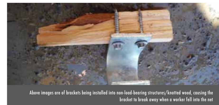
Above images are of brackets being installed into non-load-bearing structures/knotted wood, causing the bracket to break away when a worker fell into the net