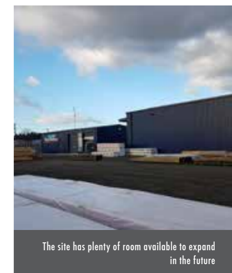
The site has plenty of room available to expand in the future

The store also features a large yard with outside storage and a covered drive-thru that is home to dry frame timber, GIB board, ply and Hardies weatherboards. With a 2,000m 2 plus yard, Garth says that there is also plenty of room available to expand the store as customer's needs evolve in the future.