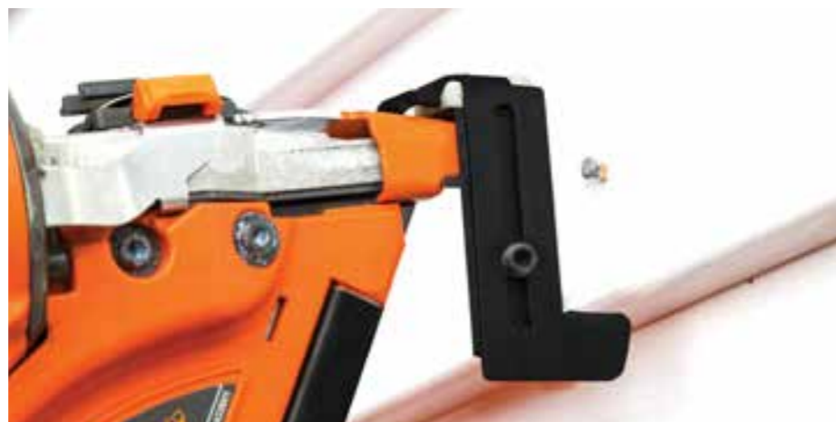
The new Paslode system promises to reduce and simplify overall installation time

For more information, visit Paslode's website: www.paslode.co.nz/JoltFast