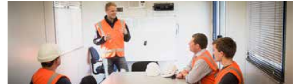
Under the Act, you need to create opportunities for workers to take part in improving health and safety

It is important to remember that under the Act, you need to engage with workers and create opportunities for them to take part in improving health and safety. Many businesses choose to have health and safety committees, as they are a well-established way to support worker engagement and participation.