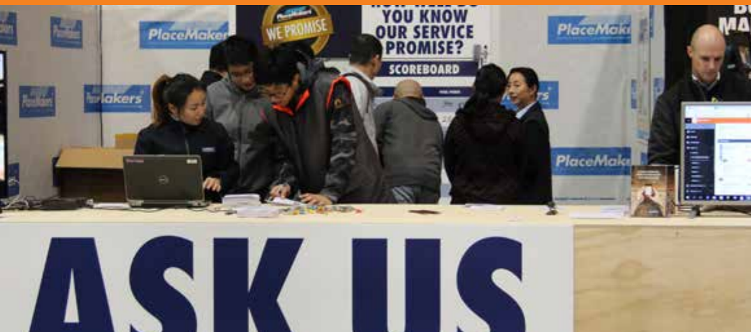
The PlaceMakers Zone was a hub of activity throughout the expo, with plenty of opportunities to build relationships with attending builders