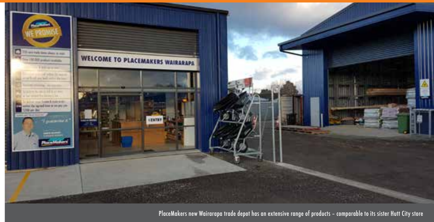
PlaceMakers new Wairarapa trade depot has an extensive range of products – comparable to its sister Hutt City store