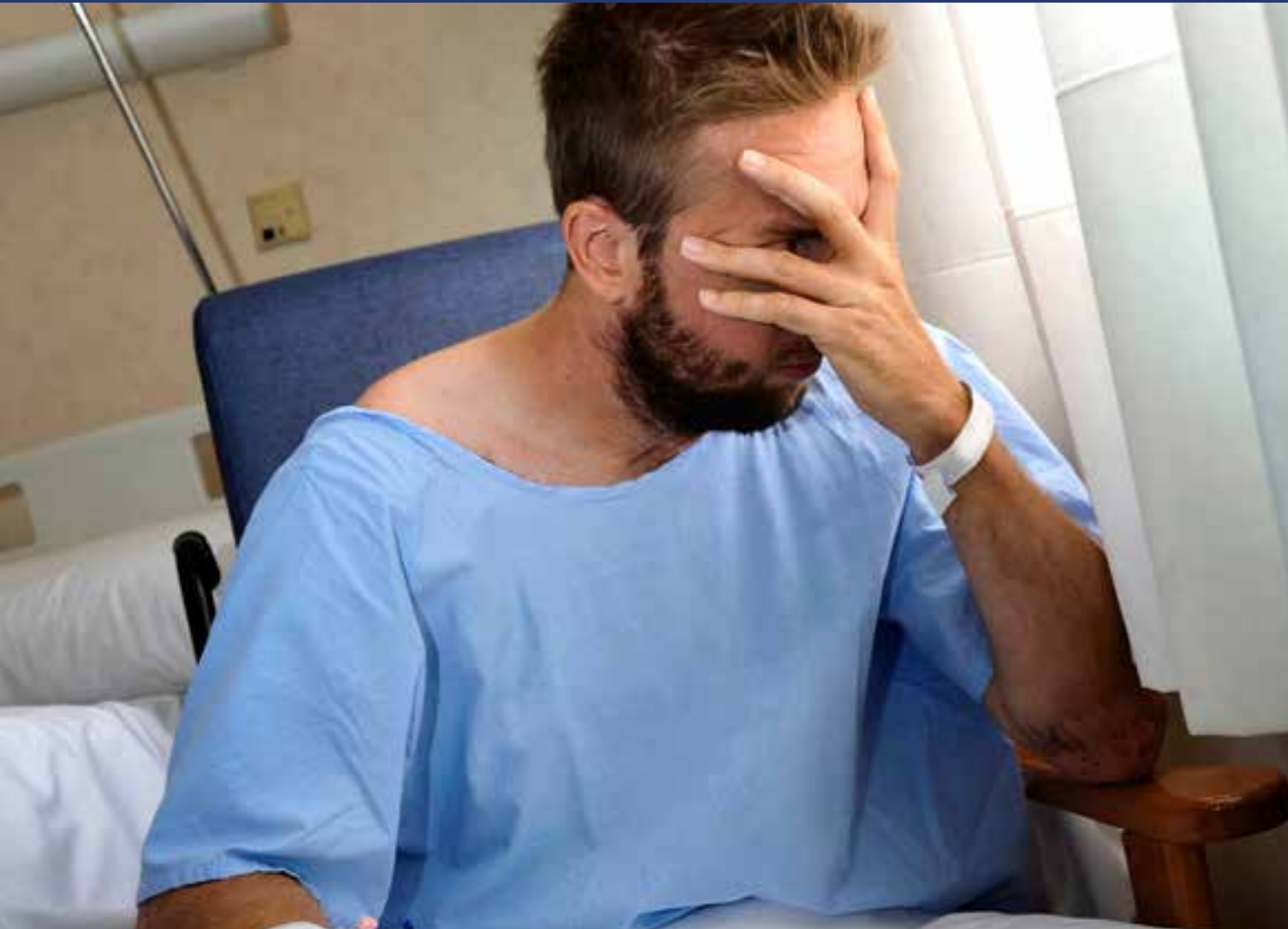
What happens to your income if you get sick?

Bultin speaks with thousands of LBPs up and down the country each year. One message that comes through consistently is that builders think ACC will cover their costs should they be forced to take time off work. However, that's not always true