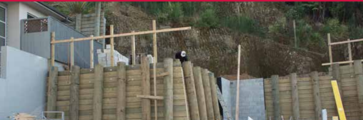
An Environment Court ruling challenging the way Wellington City Council interprets its district plan could seriously affect homeowner's building rights where a retaining wall has been constructed on a boundary