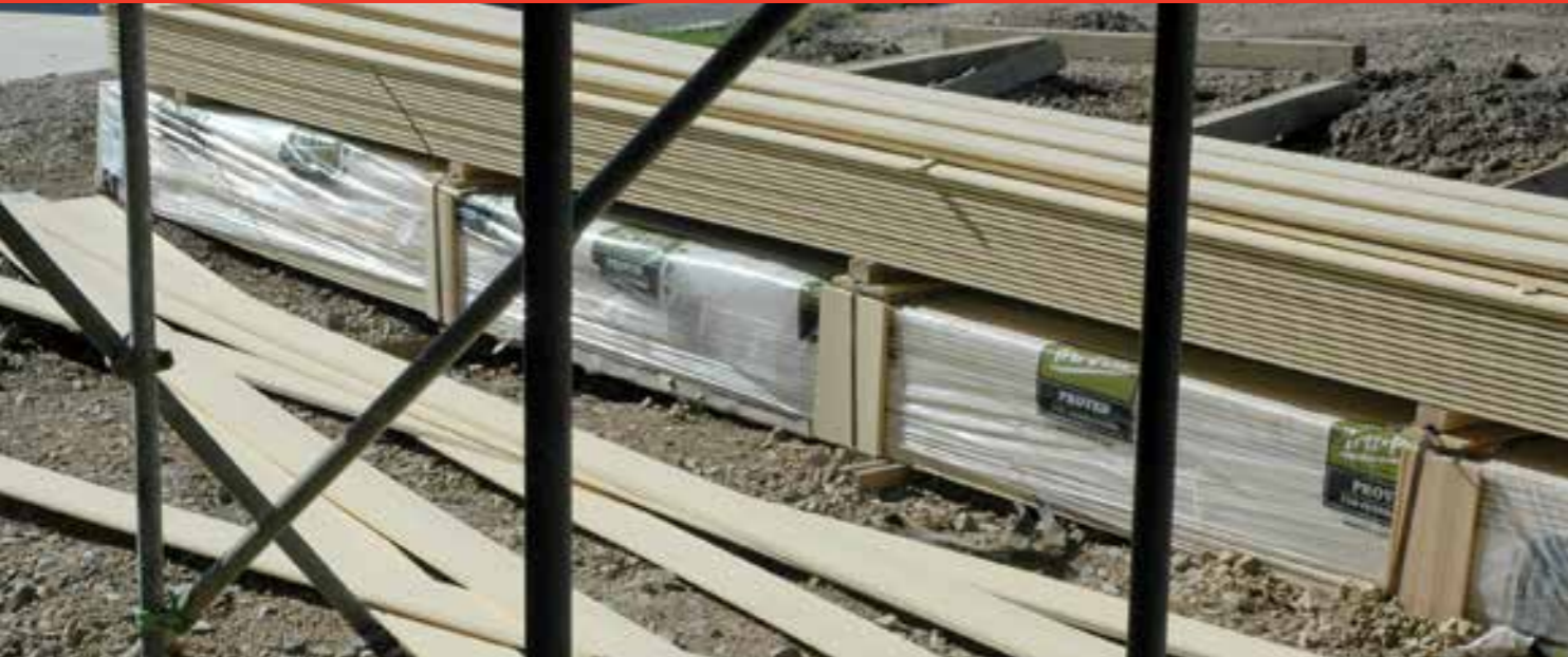
Store boards on a level surface packed clear of the ground and reject any damaged boards

While the use of timber weatherboard cladding varies with changing trends, it remains perennially popular and its design and installation is well documented