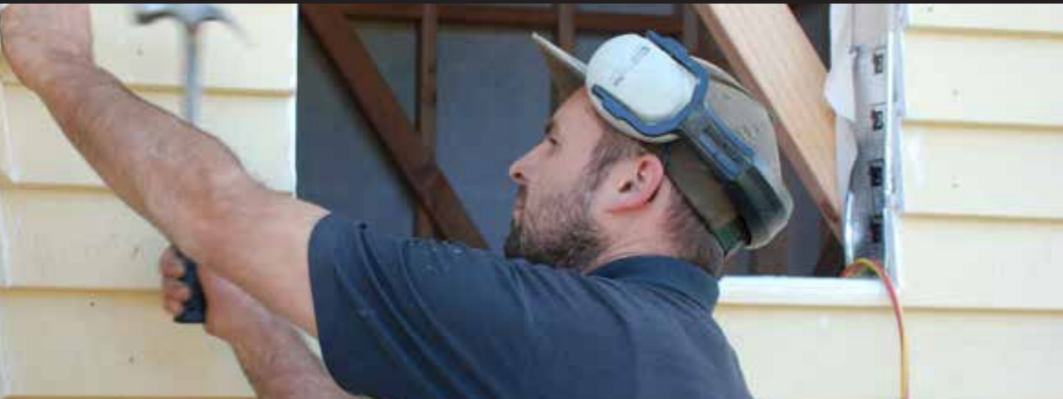
Traditionally, weatherboard application was done by hand, which made it a fairly time-consuming task

As part of an initiative undertaken by ITW Paslode New Zealand, JoltFast has launched a new system for fixing timber weatherboard that promises to significantly reduce installation time