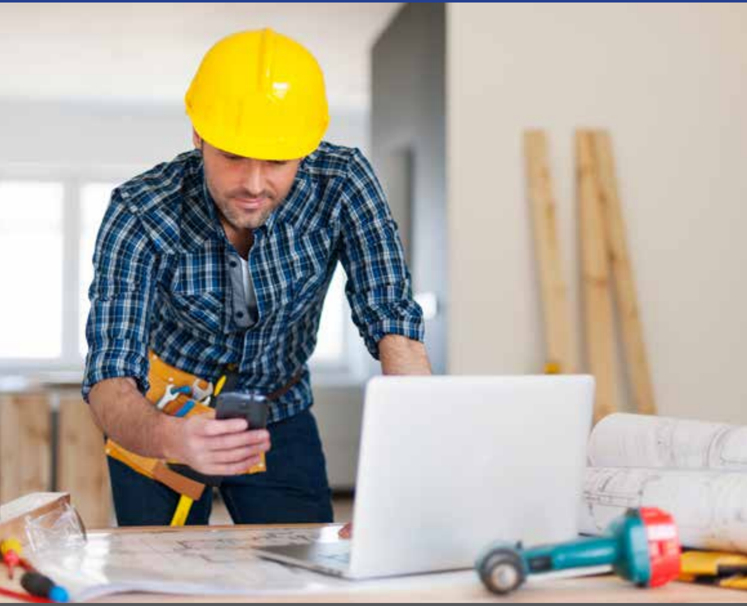
Switching off text and email notifications is a good way to remove distractions while you work through your to-do list

With the weather warming up and Christmas around the corner, the mad rush is about to begin! While it can be lucrative for builders, managing stress throughout this time is vital to your health – a prominent theme in this edition of Under Construction