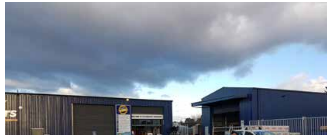
This diagram illustrates how the Environment Court ruling could affect Wellington property owners' building envelopes

of whether or not it needs to change the district plan.